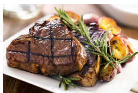
Lamb in a light sauce