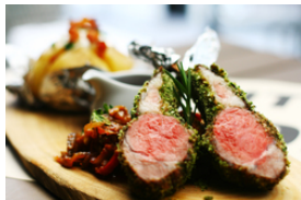
Lamb in a dark sauce