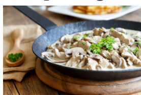
Veal in a light sauce