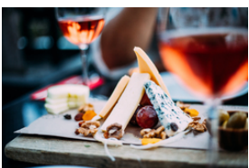
Soft cheese from goats' or ewes' milk