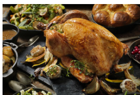
Poultry dishes with dark sauce