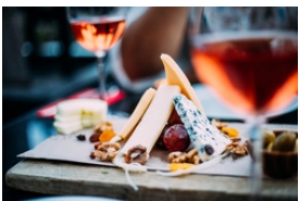
Soft and blue cheese