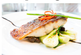
Grilled or fried fish