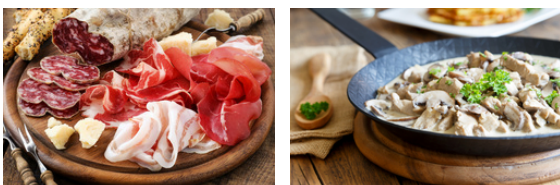
Veal in a light sauce