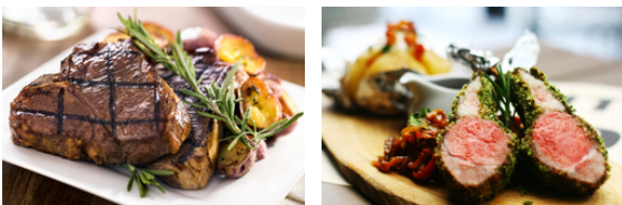
Lamb in a light sauce