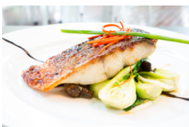
Grilled or fried fish