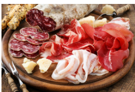
Pasta with Pesto