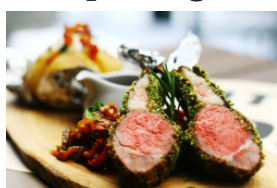
Grilled or fried lamb