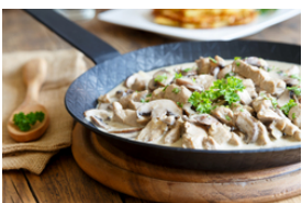
Veal in a pale sauce