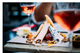
Soft cheese from cows' milk