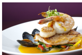
Fried or grilled seafood, with or without sauce